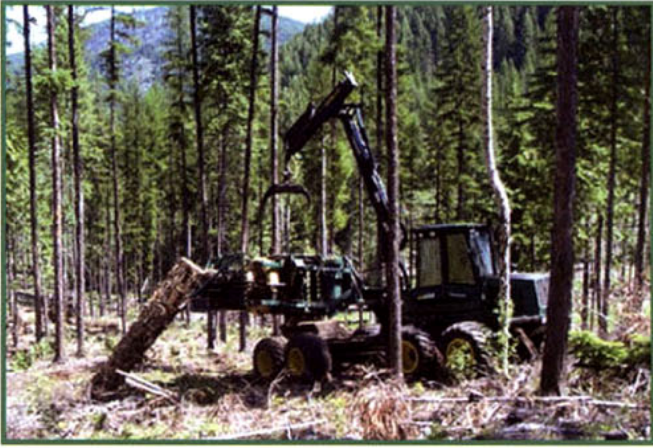
Figure 4. — Specially designed harvesting equipment bundles biomass into bales for bioenergy systems.