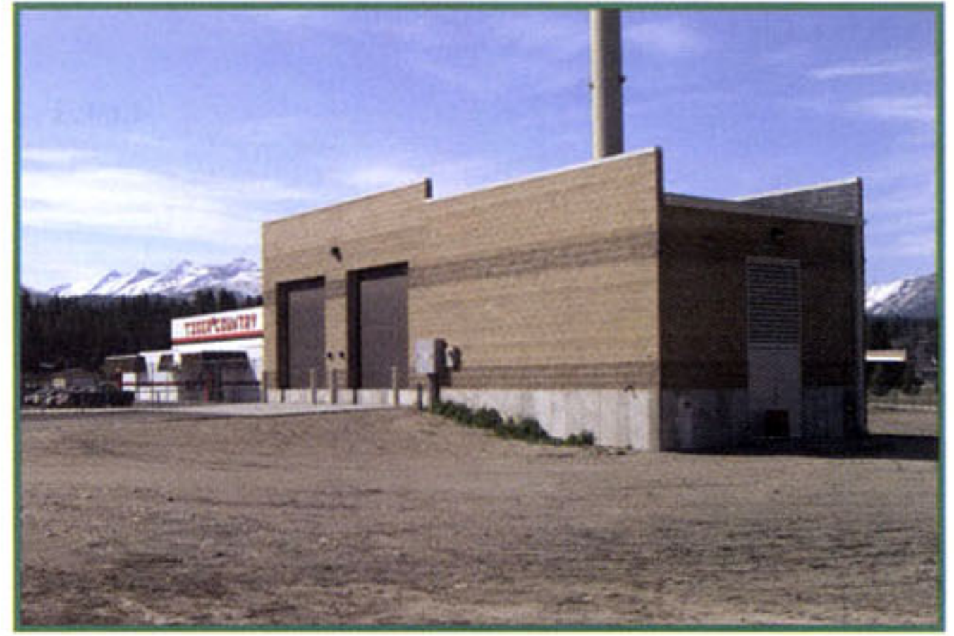
Figure 2. — This biomass-fueled boiler facility provides heat for multiple school buildings in Montana.

Bioenergy for small-scale institutional use in western states has been exemplified by the "Fuels for Schools" program (Fuels for Schools 2006), which has seen its greatest development in western Montana but is also encompassing other western states. To date, 6 systems have been