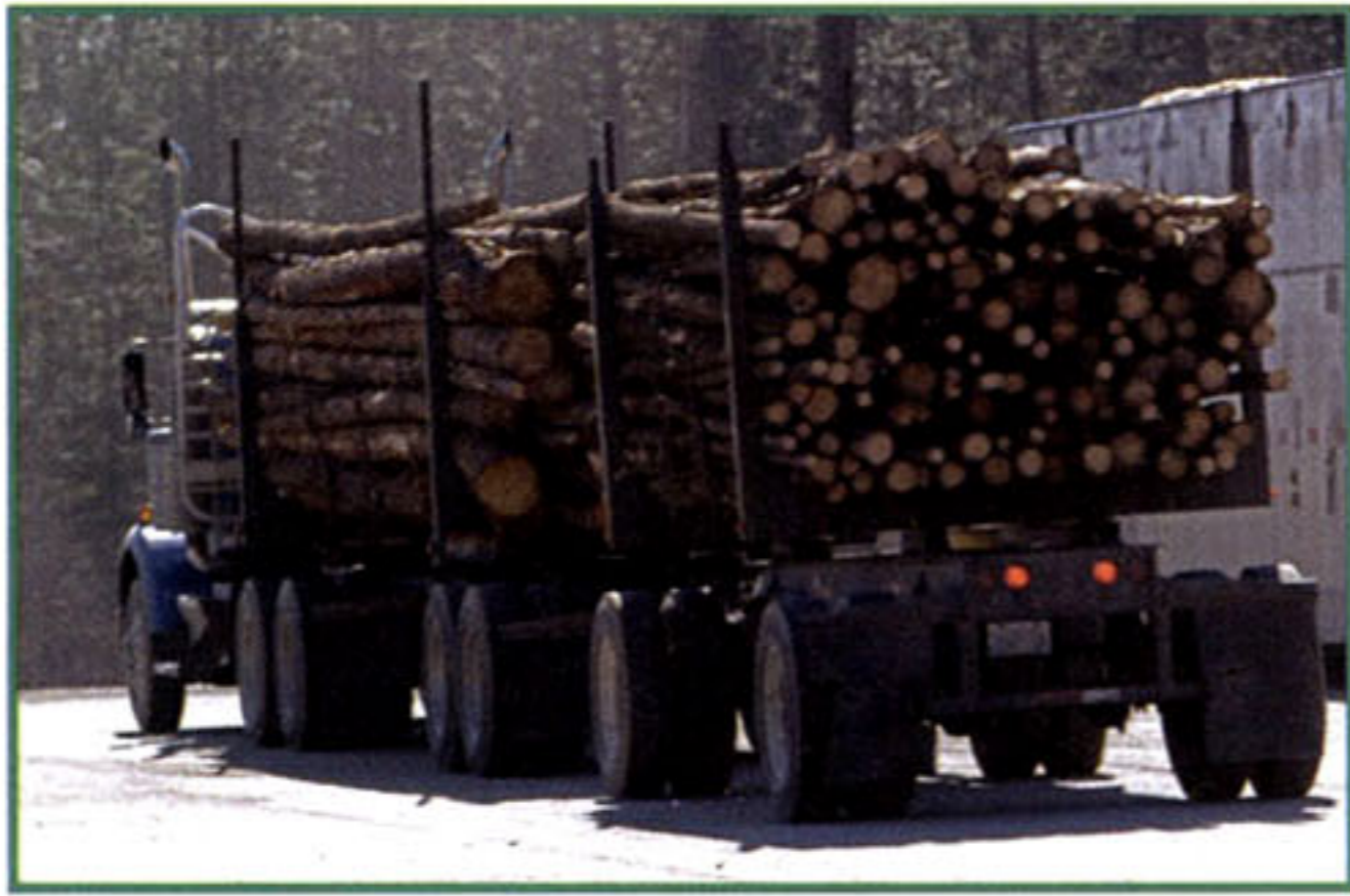
Figure 5. — Transportation cost is one factor making biomass harvesting uneconomical in the West.