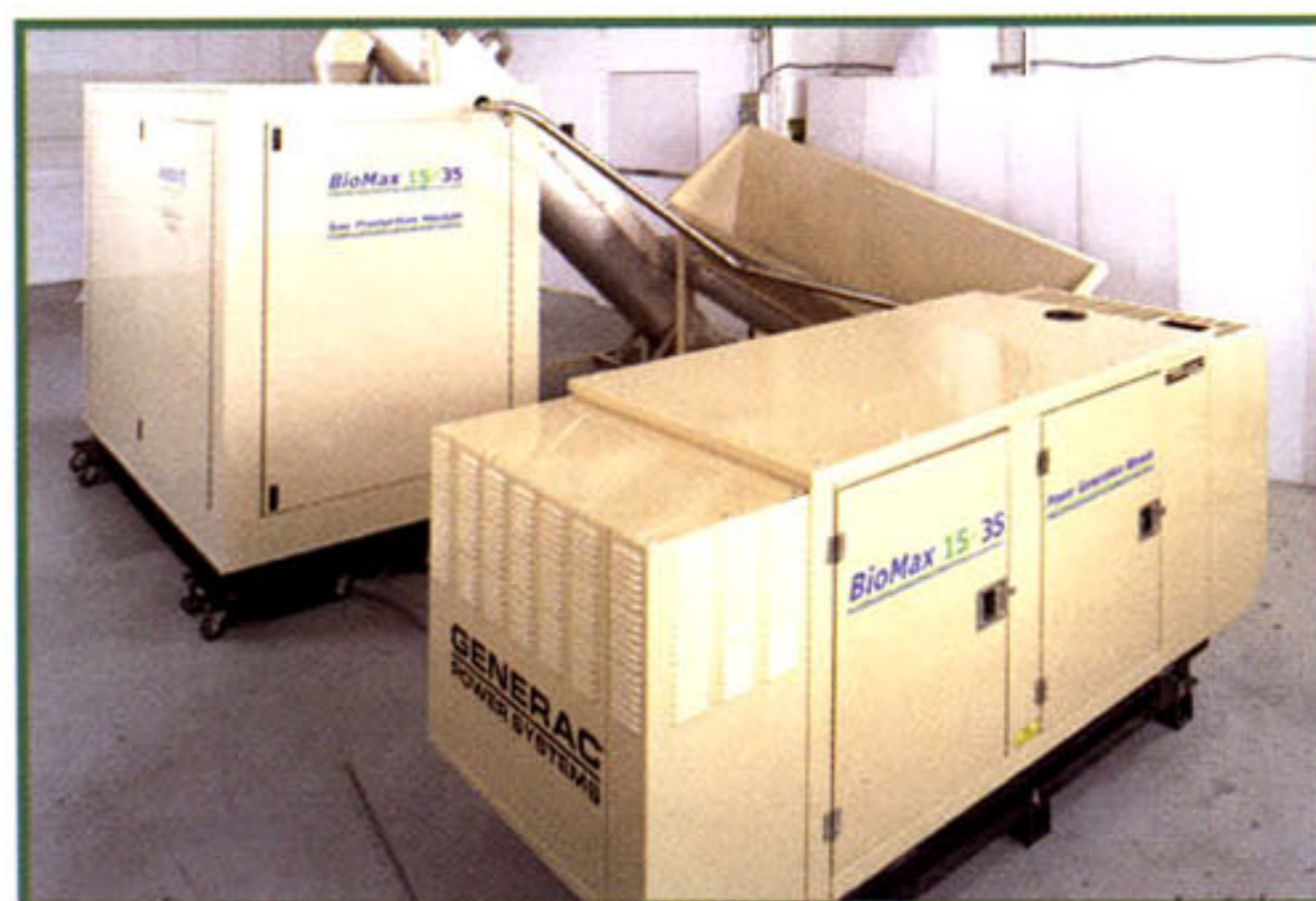
Figure 3. — This portable modular power system gasifies wood pellets or other biomass and generates 15kW electricity.

In the intermountain west, biomass resources are often dispersed and located at considerable distances